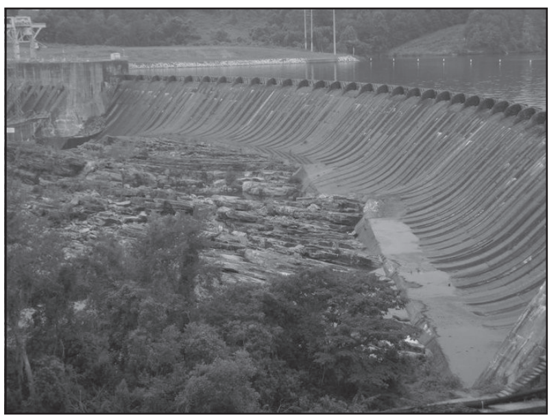
View of Thurlow Dam built atop the once famous Falls of the Tallapoosa mentioned by Mark Twain.