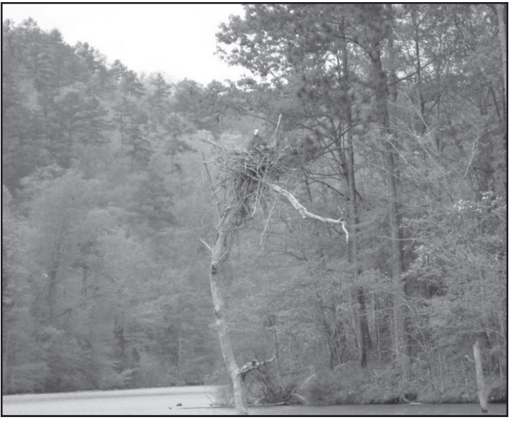
A large and fat osprey chick in a nest on a snag rising out of the water.