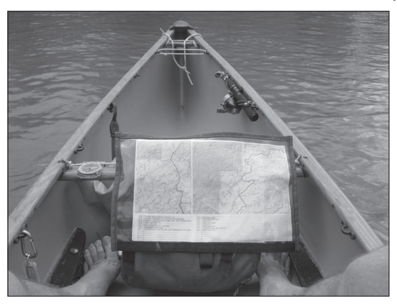
My navigation panel with two of my 20 maps showing. I had a GPS but never needed it. By watching my maps and the compass mounted on my thwart, I always knew exactly where I was.